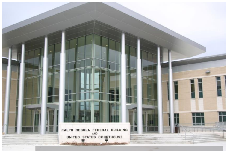
Ralph Regula Federal Building and United States Courthouse