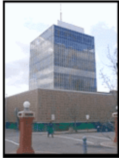
City Hall Canton Municipal Court