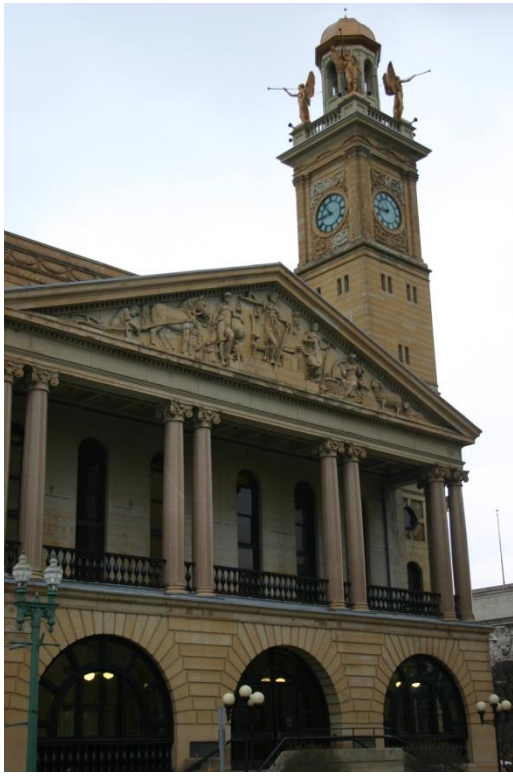
Stark County Court of Common Pleas