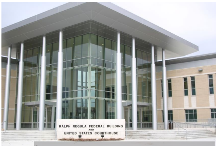
Ralph Regula Federal Building and United States Courthouse