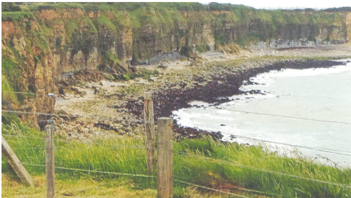
Pointe du Hoc (Rangers climbed on June 6th)

We visited the fiercely defended battle site where our courageous soldiers stormed all five beaches and fought through the French countryside for our freedom.