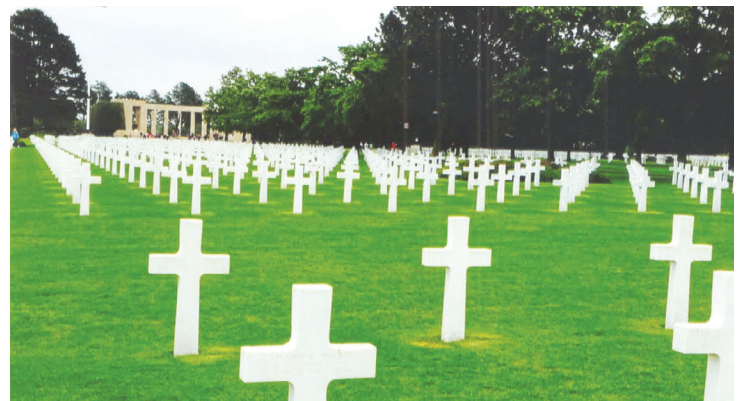
American Cemetery - Normandy