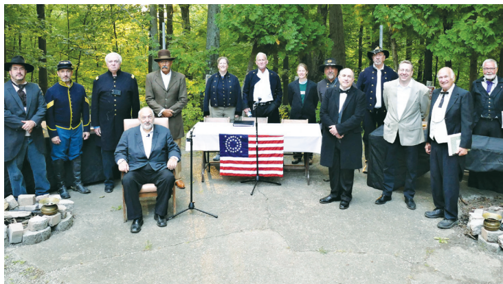
Andersonville Trial at Camp Tuscazoar

War “Andersonville Trial” at Camp Tuscazoar. I’ve had the opportunity to see it twice and it is a wonderful show.