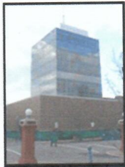
City Hall Canton Municipal Court