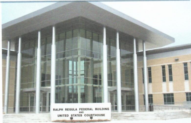
Ralph Regula Federal Building