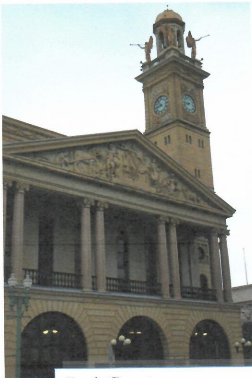
Stark County Court of Common Pleas